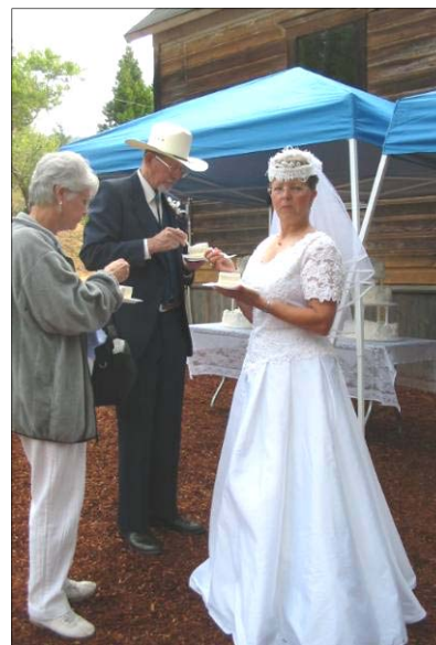
One of the brides enjoying cake with her family.

Golden was spruced up and looking wonderful, thanks in part to Evergreen Federal Bank and staff, who were a huge help in prepping Golden for its public debut. Montgomery Construction pitched in and got the foundation project looking spiffy just in time for a great community event.